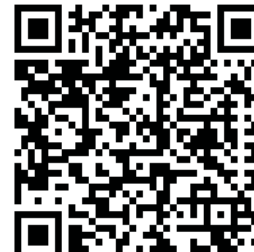
DSB Installation Sheet