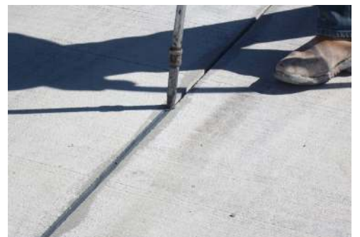
Silicone Installation, Fort Bliss, Texas