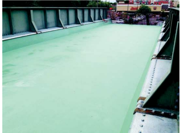
Deckguard® Waterproofing System, Greenleaf Avenue Bridge, Chicago, IL