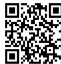
YouTube Video - Delpatch

*Delcrete is available in various unit sizes that require different mixing ratios. Please refer to your actual Delcrete packaging to confirm which of these Delcrete installation instructions are applicable to your product.