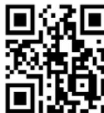
YouTube Video - Delcrete Elastomeric Concrete

GHS Product Identifier : Delcrete/Delpatch DSB 1494 B NM CAS No. : Proprietary Chemical Family : Polyol/Diamine blend. Product Use : For industrial or professional use only. This material is used as a curing agent for the production of cast polyurethane. Supplier : The D.S. Brown Company 300 East Cherry Street North Baltimore, Ohio 45872 419-257-3561 In Case of Emergency : Chemtrec 1-800-424-9300 International 01-703-741-5500