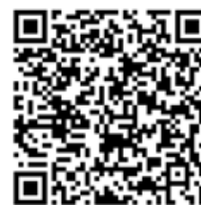
DSB Installation Sheet Delcrete with Sand / Fiberglass Aggregate System*